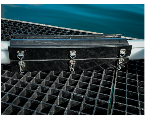
4. Close the latches