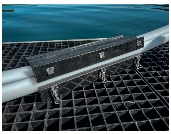
3. Adjust latches